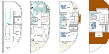
PLANTA B01 PLANTA B02 PLANTA B03 PLANTA B04