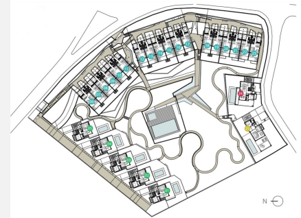
3 Bedroom Townhouse at La Vera de Marbella, Elviria