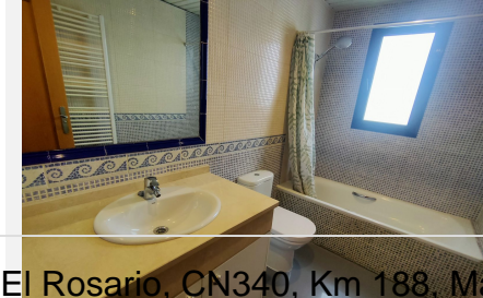
n E<mark>l Rosario, CN340, Km 188, Ma</mark>rbella,