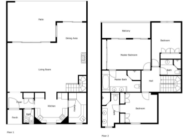
Measurements Calculated and Deemed Highly Reliable But Are Not Guaranteed