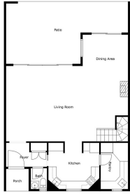
Measurements Calculated and Deemed Highly Reliable But Are Not Guaranteed