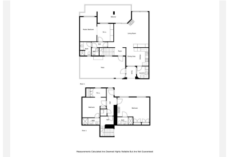
Measurements Calculated and Corrected. Rights Reserved. But Are Not Guaranteed.