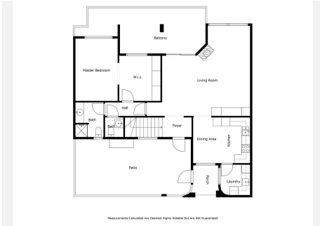
Measurements Calculated and Corrected. Rights Reserved. But Are Not Guaranteed.