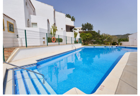
CASA ADOSADA LA RESERVA DE MARBELLA - MARBELLA (MÁLAGA)