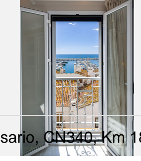
Km 188, Marbella,