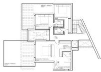
PLANTA ALTA / FIRST FLOOR