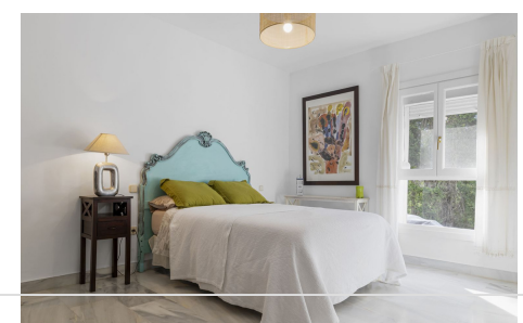
Urbanizacion El Rosario, CN340, Km 188, Marbella,