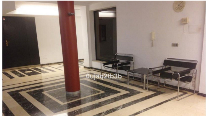
OFICINA EN VENTA