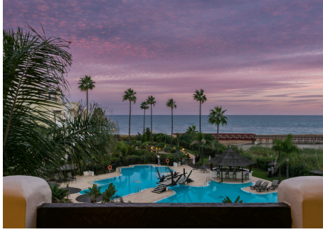
URBANIZACIÓN BAHÍA VELERÍN S.L.