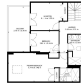
Matterport FLOOR 2