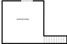
EXERCISE ROOM GROSS INTERNAL AREA FLOOR 1: 122.00 m 2 (1316.00 sq. ft.) NET AREA: 72.00 m 2 (774.00 sq. ft.) TOTAL: 122.00 m 2 (1316.00 sq. ft.)