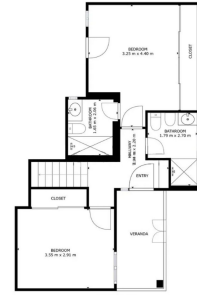
BEDROOM BATHROOM GROSS INTERNAL AREA FLOOR 2: 122.00 m 2 (1316.00 sq. ft.) NET AREA: 72.00 m 2 (774.00 sq. ft.) TOTAL: 150.00 m 2 (1620.00 sq. ft.)