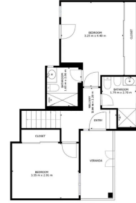
Detailed floor plan showing multiple rooms and their dimensions.