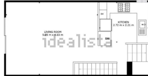
LIVING ROOM KITCHEN GROSS INTERNAL AREA FLOOR 1: 122.00 m 2 (1316.00 sq. ft.) NET AREA: 72.00 m 2 (774.00 sq. ft.) TOTAL: 150.00 m 2 (1620.00 sq. ft.)