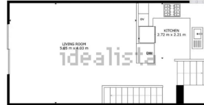
LIVING ROOM GROSS INTERNAL AREA FLOOR 1: 122.00 m 2 (1316.00 sq. ft.) NET AREA: 72.00 m 2 (774.00 sq. ft.) TOTAL: 122.00 m 2 (1316.00 sq. ft.)