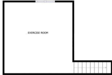
EXERCISE ROOM GROSS INTERNAL AREA FLOOR 1: 122.00 m 2 (1316.00 sq. ft.) NET AREA: 72.00 m 2 (774.00 sq. ft.) TOTAL: 150.00 m 2 (1620.00 sq. ft.)