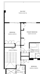
TOTAL: 299 m 2 Basement: 42 m 2 , 1st Floor: 82 m 2 , 2nd Floor: 87 m 2 , 3rd Floor: 4 m 2 EXCLUDED AREA: BALCONY: 55 m 2 , PATIO: 30 m 2 , COVERED PATIO: 48 m 2 , ROOFTOP TERRACE: 78 m 2 , WALLS: 18 m 2