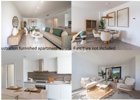
Illustration furnished apartment - Furniture not included

Example furnished apartment - only for illustration purposes furniture not included